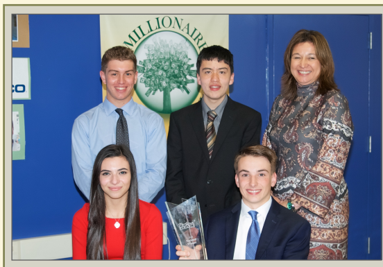
National Personal Finance Challenge Champions All Millionaire's Club Members

Credit unions sponsor their Clubs and serve as occasional guest speakers on topics such as budgeting, credit, and choosing a financial institution. Local, regional, and national competitions complete the program.