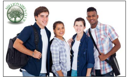
Millionaire's Club members from a Howard County high school recently won top honors in the 2021 Maryland Personal Finance Challenge.

Congratulations to the Millionaire's Club at the Applications and Research Lab Finance Academy for placing first in the Maryland Personal Finance Challenge!