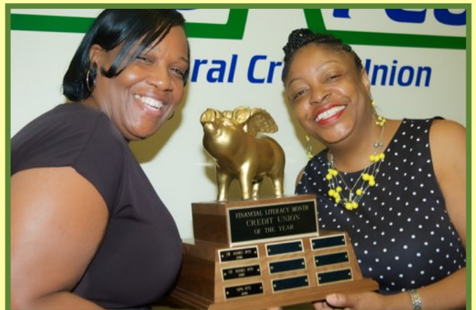
GPO FCU - Reigning Financial Literacy Month Credit Union of the Year!

And, the credit union that raises the most will receive the Financial Literacy Month Credit Union of the Year Trophy! ( calculated by funds raised / total membership )