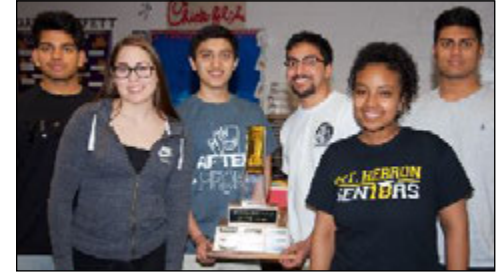
Student leadership from the Mt. Hebron High School Millionaire's Club pose with their Club of the Year Trophy.

The Millionaire's Club from Mt. Hebron High School in Ellicott City was selected 2018 Millionaire's Club of the Year recently. The designation, which includes the unique "gold bar" traveling trophy, is presented annually by the Foundation Board to the site with an outstanding Millionaire's Club financial literacy program.