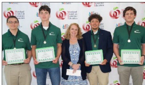
Members of the Patuxent High Millionaire's Club were honored for their first place finish in the 2019 Maryland Personal Finance Challenge.

Student members of local schools' Millionaire's Clubs were well represented at the 2019 Student Achievement Awards held by the Maryland Council on Economic Education in the SECU Arena at Towson University recently.