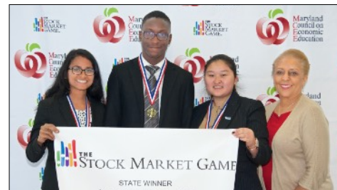
Millionaire's Club members from River Hill High School clinched the first place title in the Statewide, Year-long Stock Market Game competition.