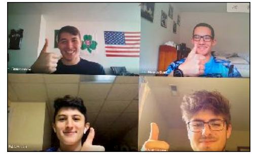
Students representing Mt. Hebron High School's Personal Finance Challenge team strike a "virtual" celebratory pose following their second place finish in the state-wide competition.

Your corresponding, numbered bottle(s) will await you at the Columbia offices of the Association/Foundation for you to pick-up. (Curbside pick-up, and delivery may be worked out, too.) Get all the details at cufound.org/wine